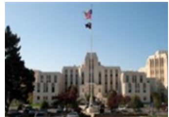
San Francisco, CA San Francisco VA Medical Center San Francisco, CA