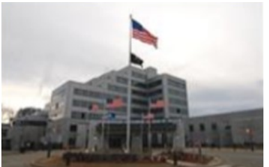
West Haven, CT VA Connecticut Healthcare System West Haven, CT