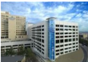
Pittsburgh, PA VA Pittsburgh Healthcare System Pittsburgh, PA