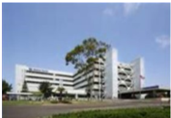
San Diego, CA VA San Diego Healthcare System San Diego, CA