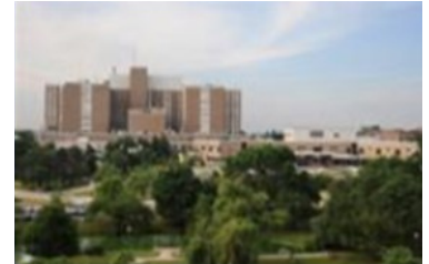
Milwaukee, WI C. J. Zablocki VA Medical Center Milwaukee, WI