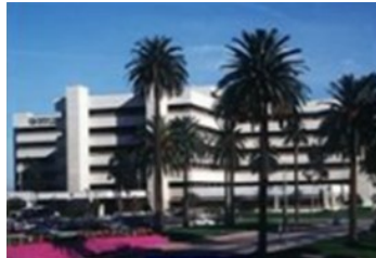
Los Angeles, CA VA Greater L.A. Healthcare System Sepulveda, CA