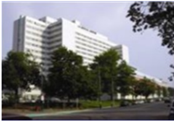
Boston, MA VA Boston Healthcare System Jamaica Planes, MA

There are eight VA AFWH program sites across the United States. Each site offers the very best advanced training opportunities for clinicians in women's health research, education and clinical care. Two fellows, a physician and an associated health professional, are accommodated at each site, each year. The different sites offer unique fellowship experiences due to the varying activities, affiliations, clinical opportunities, research projects, program staff and mentors available and embedded in the site. For site-specific information, explore the individual site pages by visiting afwh.wisc.edu , email WHfellowship@va.gov to reach the AFWH National Coordinating Center, or contact the program director for the site(s) that interest you.