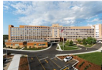
Madison, WI Wm. S. Middleton Mem. VA Hospital Madison, WI